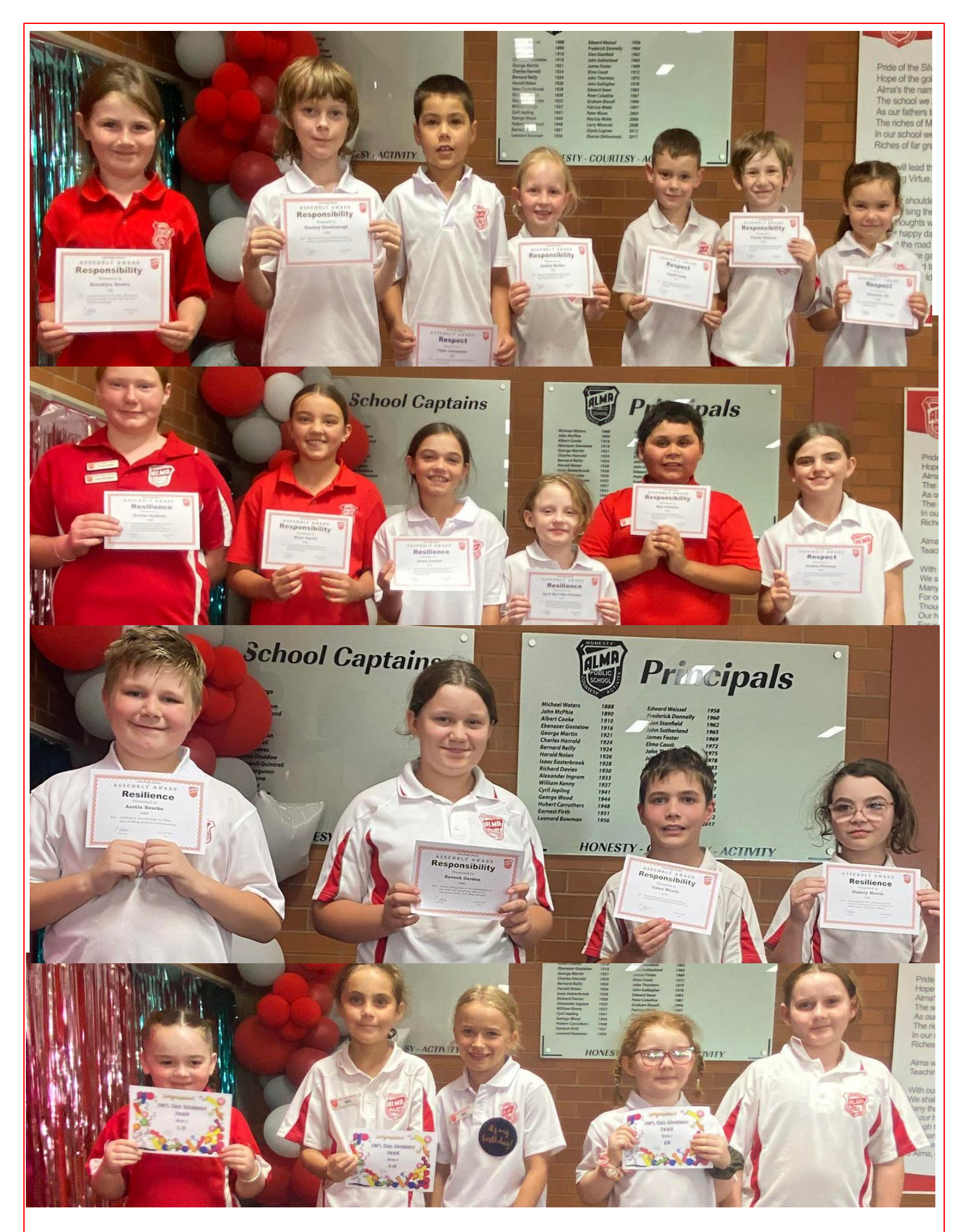
Class of the Week: 1-2J, 3-4S, 3-4W, KW, K-6W and K-6M