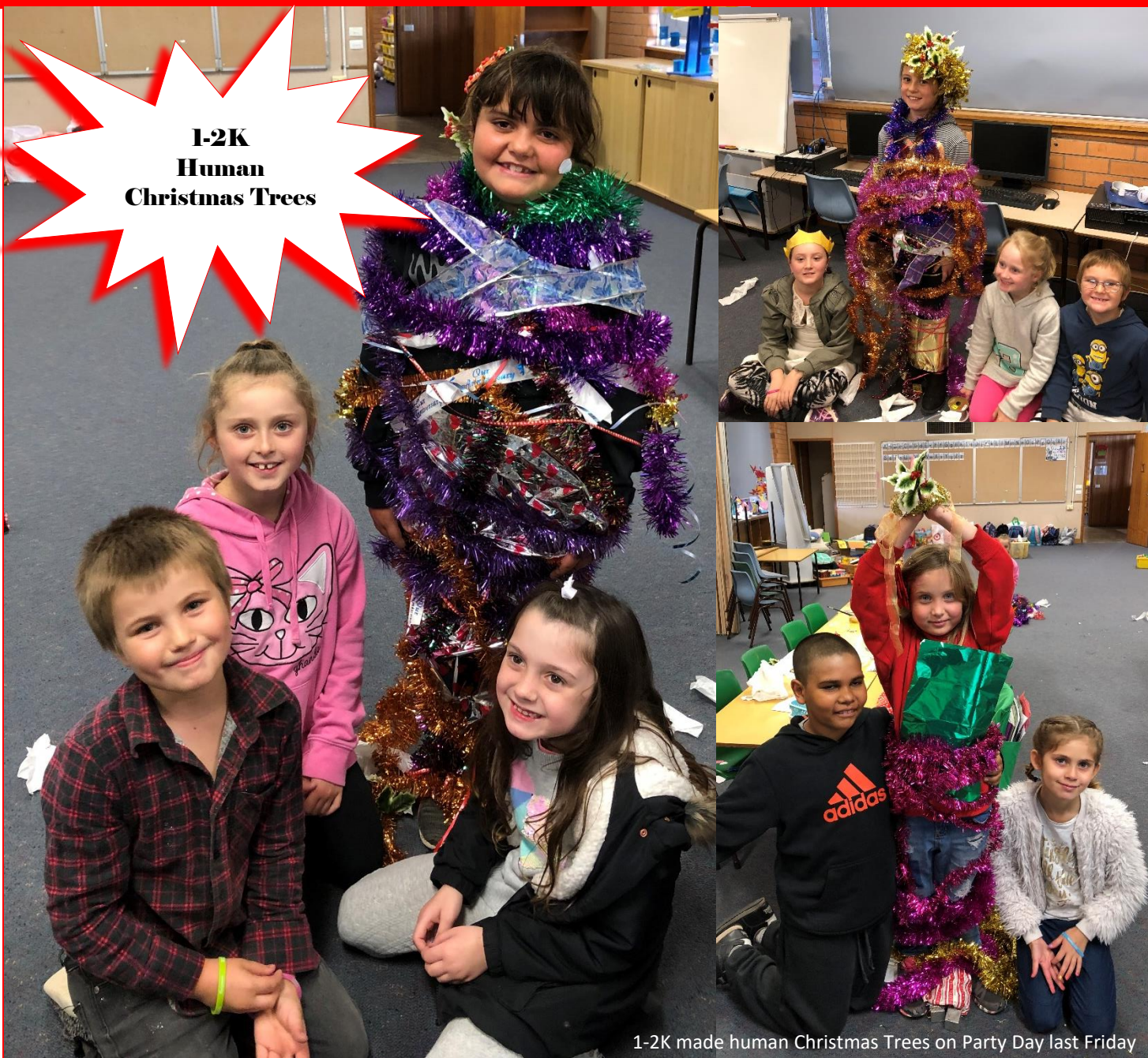
1-2K made human Christmas Trees on Party Day last Friday